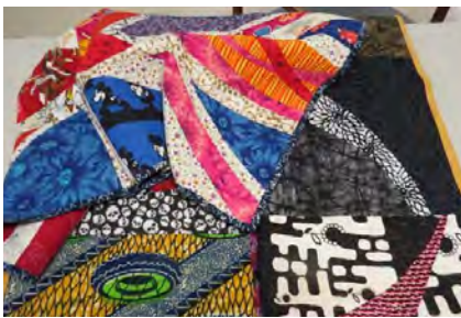
Mac MacNamara comes to SLO Quilters in March

Atascadero Sewing & Vacuum 5925 Traffic Way, Atas., 805-466-4772 atascaderosewingandvacuum.com