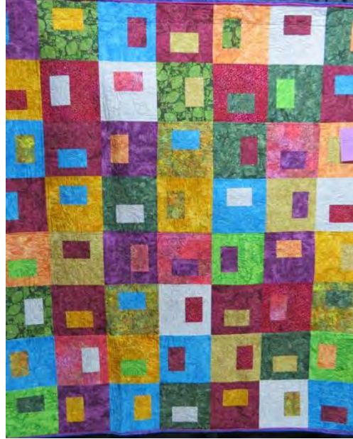
More Seven Sisters Showstoppers