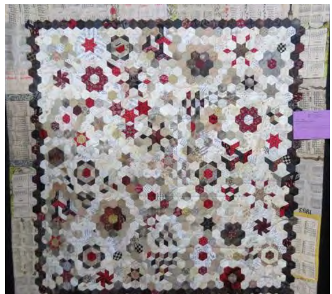
Seven Sisters Show, though not a youth.