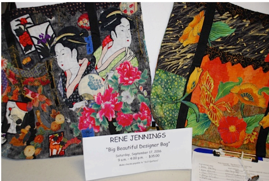
Big Beautiful Designer Bag worksop with Rene J September 17, 2016.